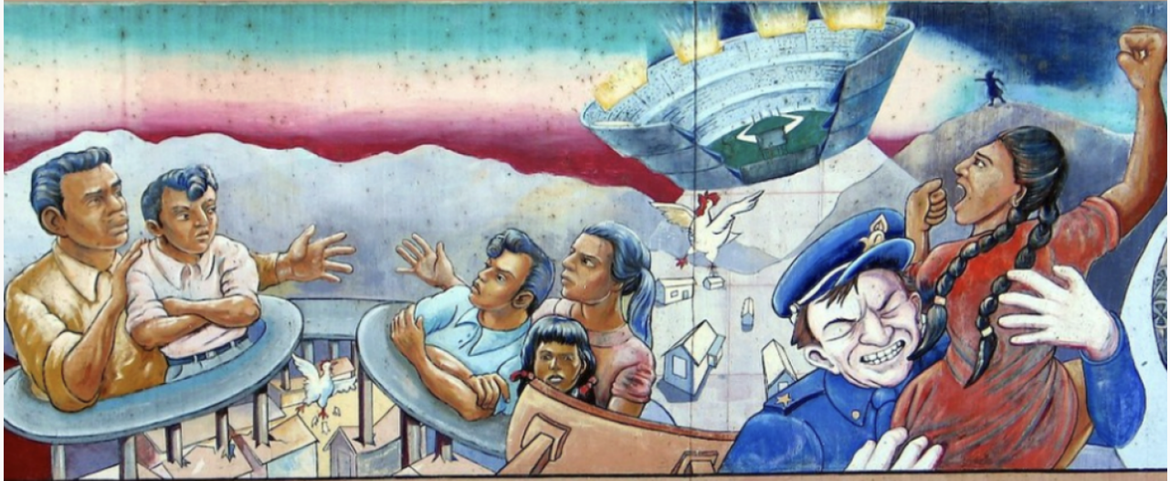
DIVISION OF THE BARRIOS & CHAVEZ RAVINE