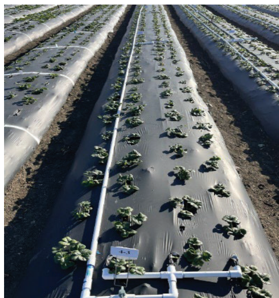
Figure 1. Manifold and drip chemigation system, picture taken on 16 Jan 2025.

This experiment was conducted on fall-planted 'Monterey' strawberries to evaluate the effect of five biological products applied via drip irrigation and/or foliar application on yield and plant health. The study took place in field 35A at the Cal Poly Strawberry Center, in a clay loam soil in a first-year strawberry planting. Four beds were shaped at 64-inch spacing, covered with black non-TIF plastic mulch and planted with four rows of bare-root transplants on 1 Nov 2024. Each bed, representing a replicate, was divided into six plots, with 66 plants per treatment. Treatments were delivered through three drip irrigation lines (Fig. 1). Foliar treatments were applied using a backpack sprayer. Plants were fertilized following standard growing practices with 5 lb N/acre/week from Jan through Mar, increasing to 10 lb N/acre/week from Apr through Jul. Treatments were applied every three weeks, from 16 Jan to 24 Jul. Applications were made at max label rate. Plant vigor was assessed both visually (on a 1–10 scale) and aerially using NDRE drone imagery (Fig. 2). Fruit (both marketable and unmarketable) were harvested weekly beginning 4 Apr and transitioned to bi-weekly from 23 May to 3 Jun, due to increased fruit volume for a total of 12 harvests.