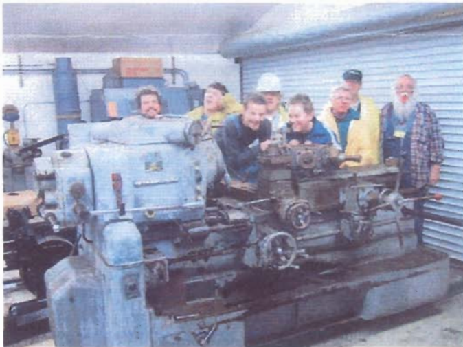
Lathe moving crew