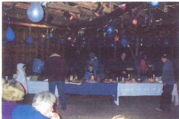
New Year Eves dinner

REMINDER: BEFORE LEAVING SWANTON'S PREMISES, PLEASE, BE SURE TO FILL OUT & SIGN THE WORK LOG FOR HOURS YOU WORKED. THE WORK LOG IS IN THE MACHINE SHOP NEXT TO THE PHONE.