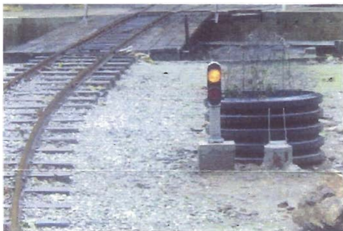
Turn table light