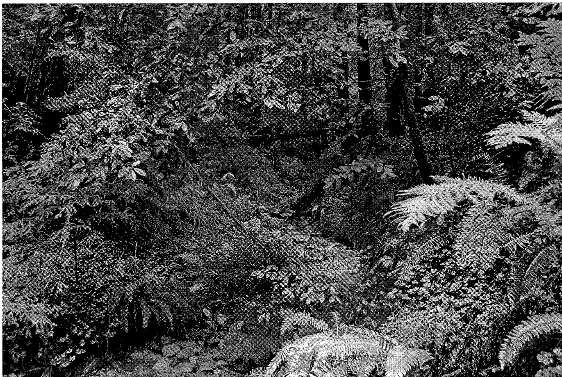
Little Creek 2005

Many years of hard work, thought, and effort have gone into sustainable forest management at Swanton Pacific Ranch from many different individuals. This page and the list below honors those who have contributed to this project in the past and the present: