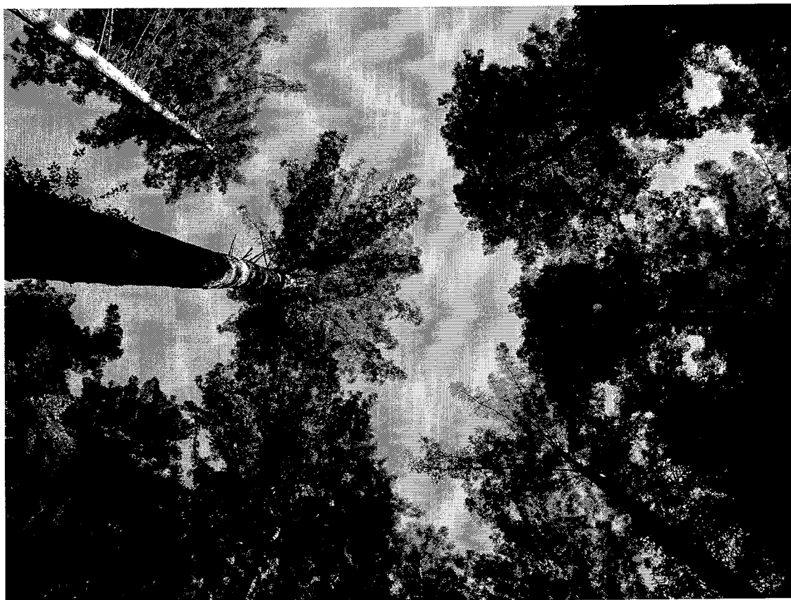
Al Smith tree rising above others in Tranquility Flats 2005