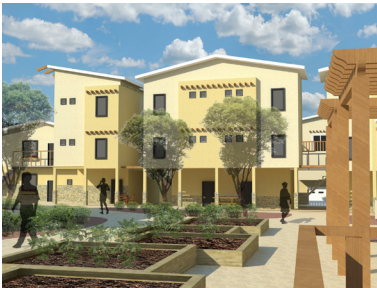
Cambria Pines, Cambria 2013 winner