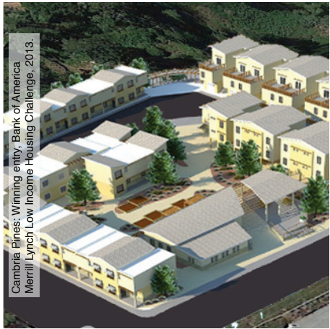
Cambria Pines: Winning entry, Bank of America Merrill Lynch Low Income Housing Challenge, 2013.

CRP City & Regional Planning Department College of Architecture and Environmental Design, Cal Poly 1 Grand Avenue, San Luis Obispo CA 93407-0283