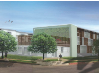
Alere, Inglewood 2012 winner