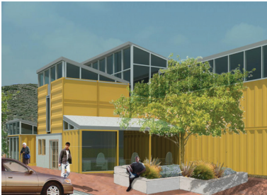
Entrada, San Luis Obispo 2011 winner