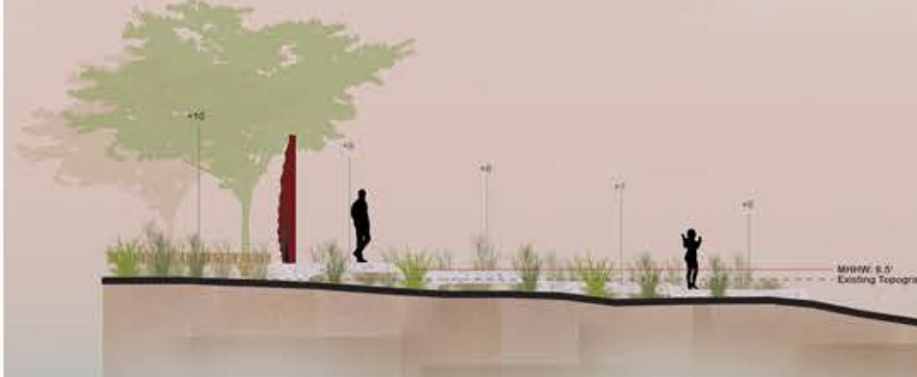
SECTION B-B': SHORELINE DETAIL || 海岸线