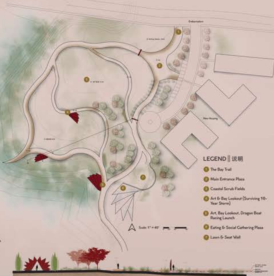
SECTION A-A: ENTRANCE TO SHORELINE || 大门