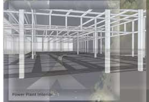
Power Plant Interior