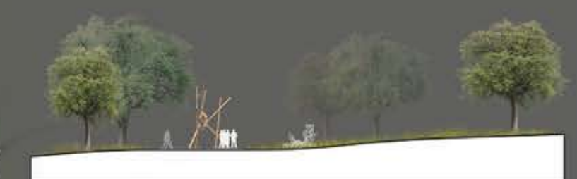
Public Art Hill