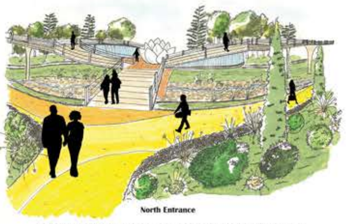
North Entrance The view from the north entrance of the central area depicts the first of many raised platforms providing a new perspective of the entire park and the connections throughout. Rather than the simple walk around the park, the elevated platforms provide the user a chance to see the entire park.