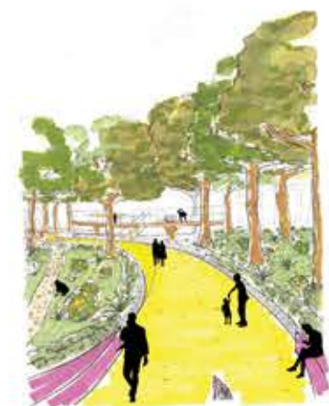
West Entrance Coming from the west, people are greeted with the view of the stream and the platforms in the distance. Seat walls are provided for those waiting for friends in anticipation of going on the elevated platforms.