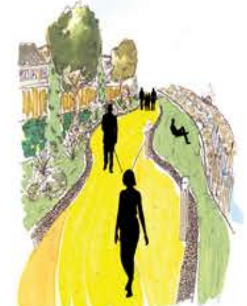
Path The path alongside of the boundaries are for the leisure stroll of visitors with open access to the surroundings.