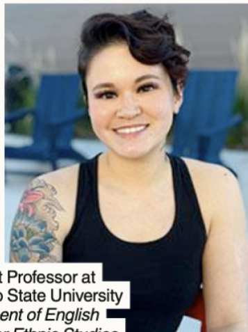
Assistant Professor at The Ohio State University Department of English Center for Ethnic Studies

Join us for a discussion about Asian American rhetoric, racial allegory, and how it shapes our understanding of what it means to be human