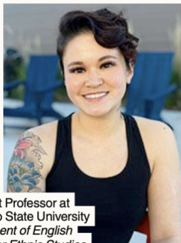
Assistant Professor at The Ohio State University Department of English Center for Ethnic Studies

Join us for a discussion about Asian American rhetoric, racial allegory, and how it shapes our understanding of what it means to be human