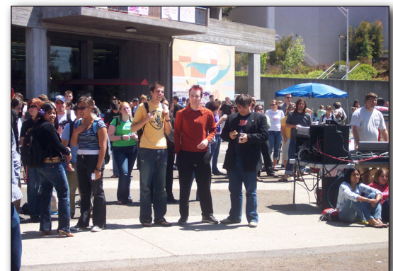
Students at University Union Plaza