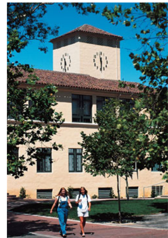
The historic Cal Poly Clocktower at the College of Education

The average load for all students in Fall 2005 was 14.03 with undergraduates carrying a load of 14.20 and post-baccalaureate students carrying a load of 11.04. This total student average load of 14.03 is down from last year's load of 14.20.