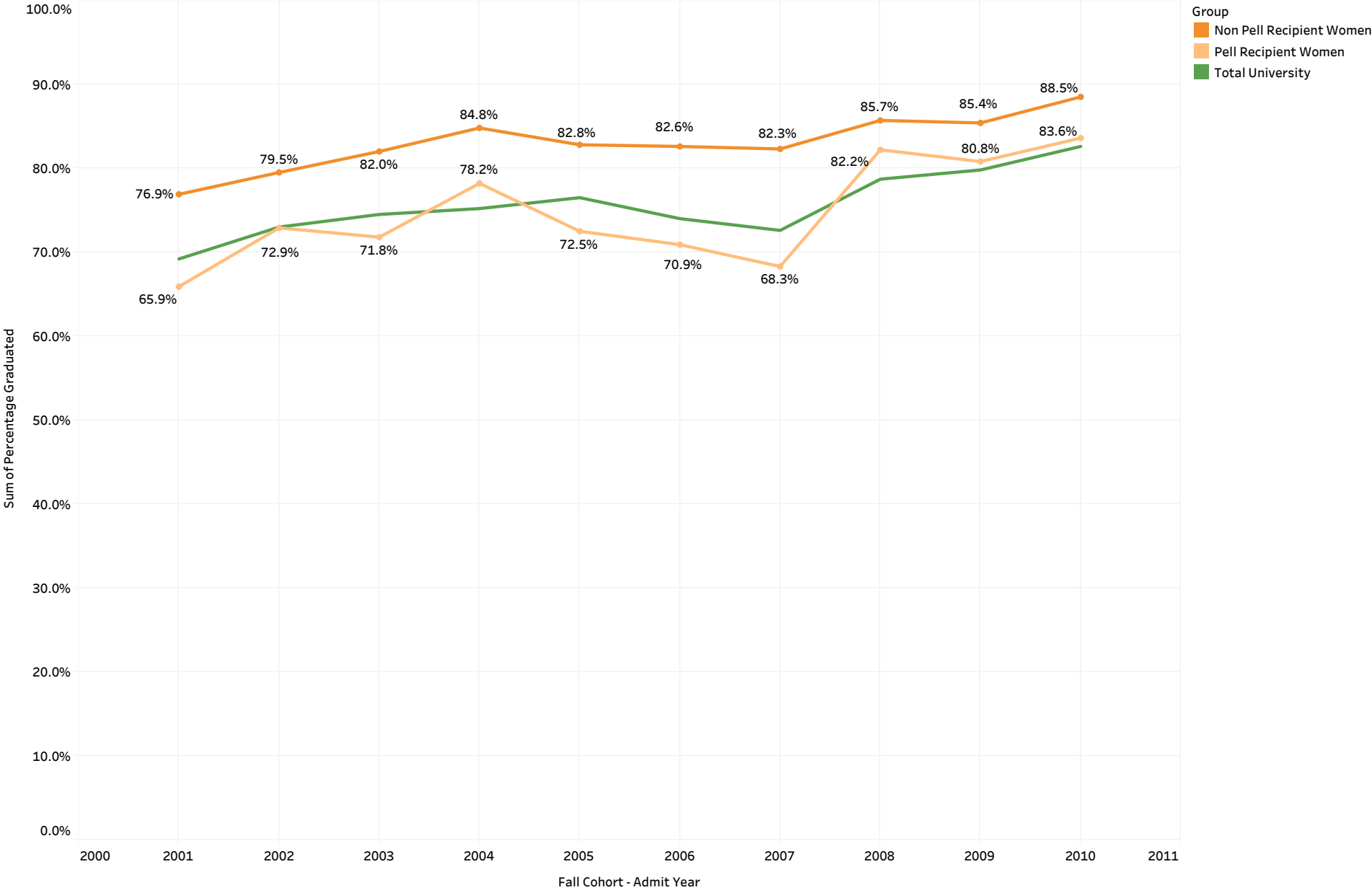
Cal Poly 6 year Graduation Rate Gender Gap - Pell Recipients over 10 Years - Women - Pell vs Non Pell