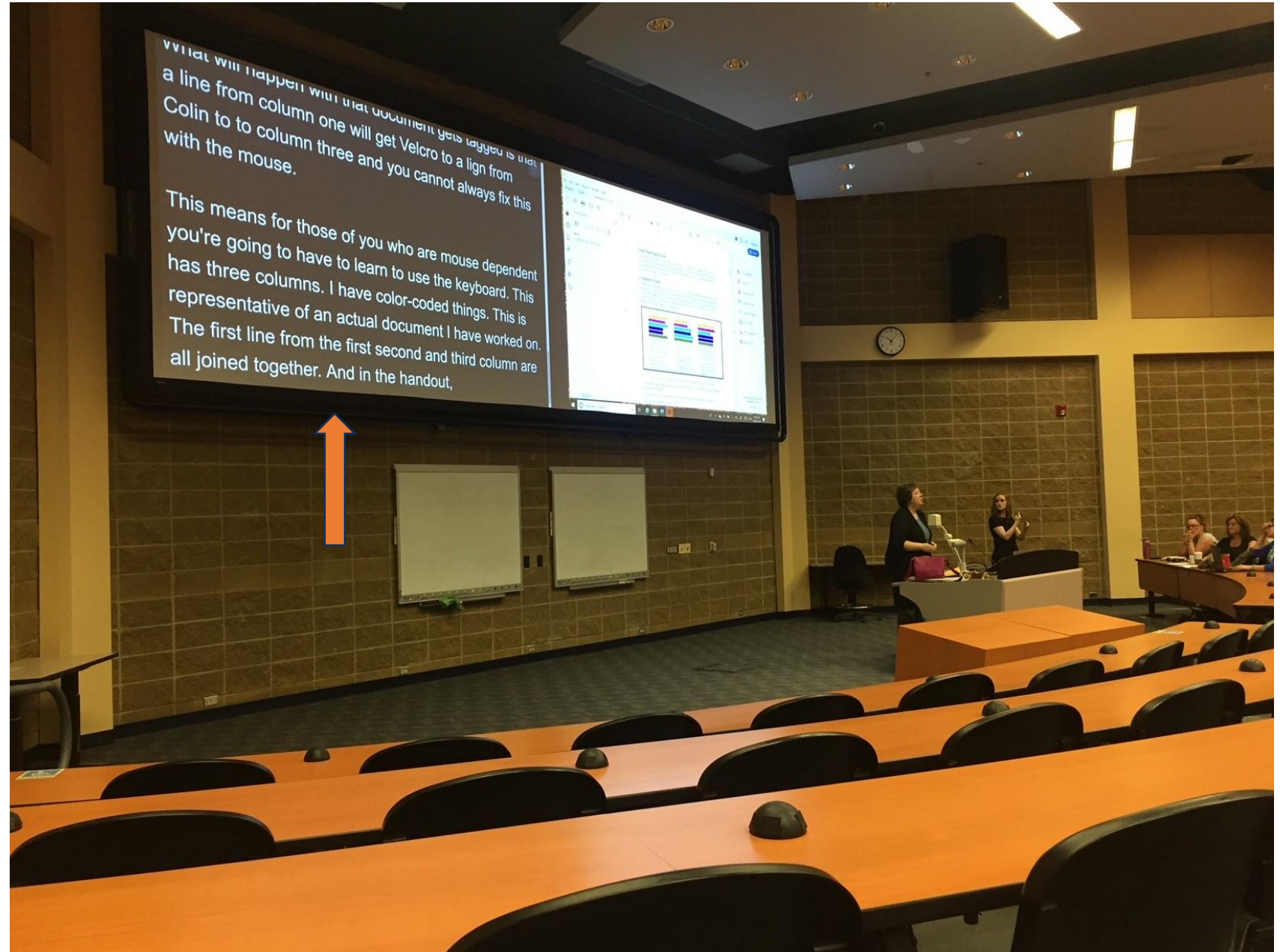
CART captions displayed on big screen at University of Guelph Accessibility Conference in 2018