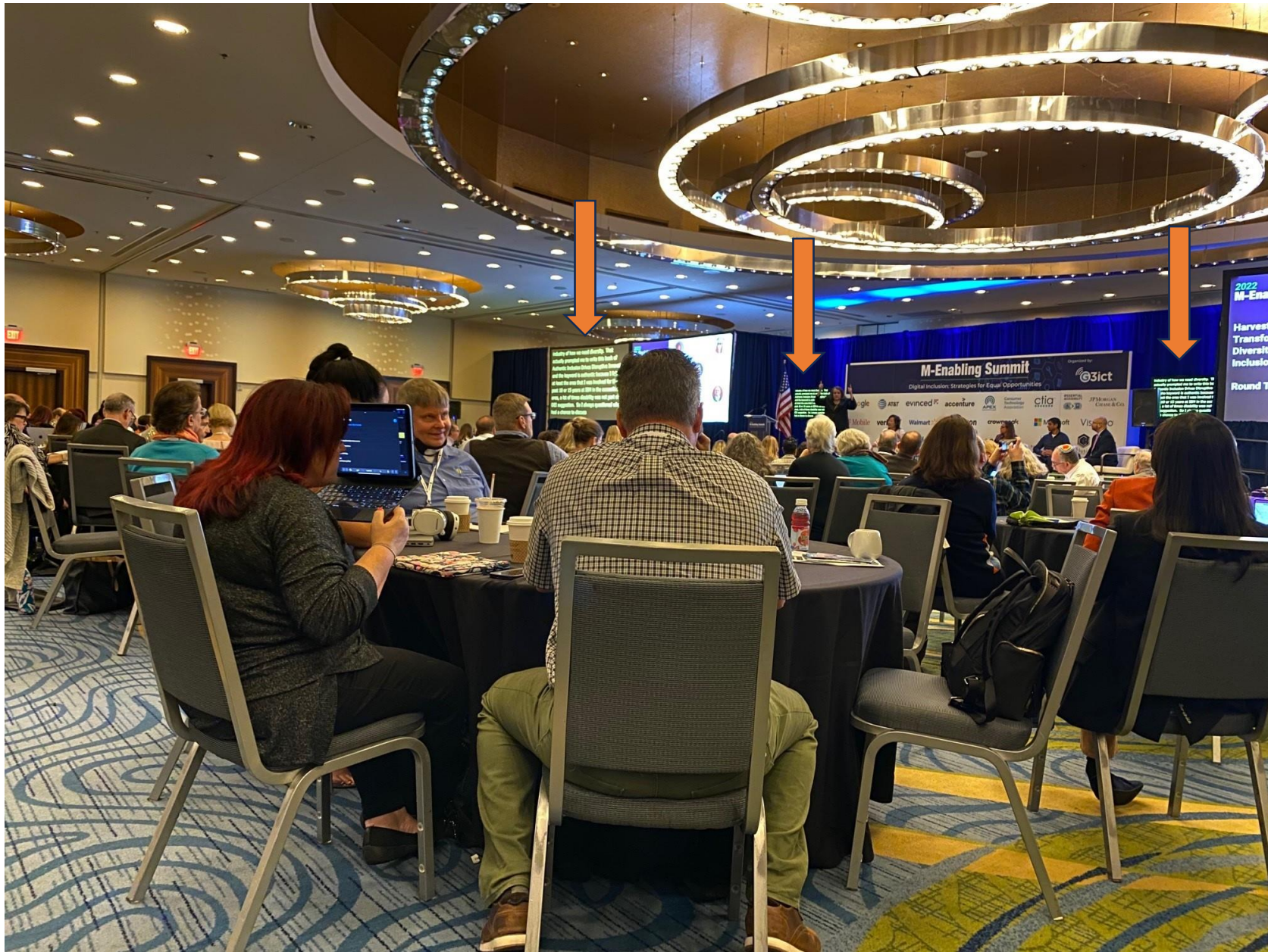
CART captions displayed on screens at M-Enabling Summit 2022 conference