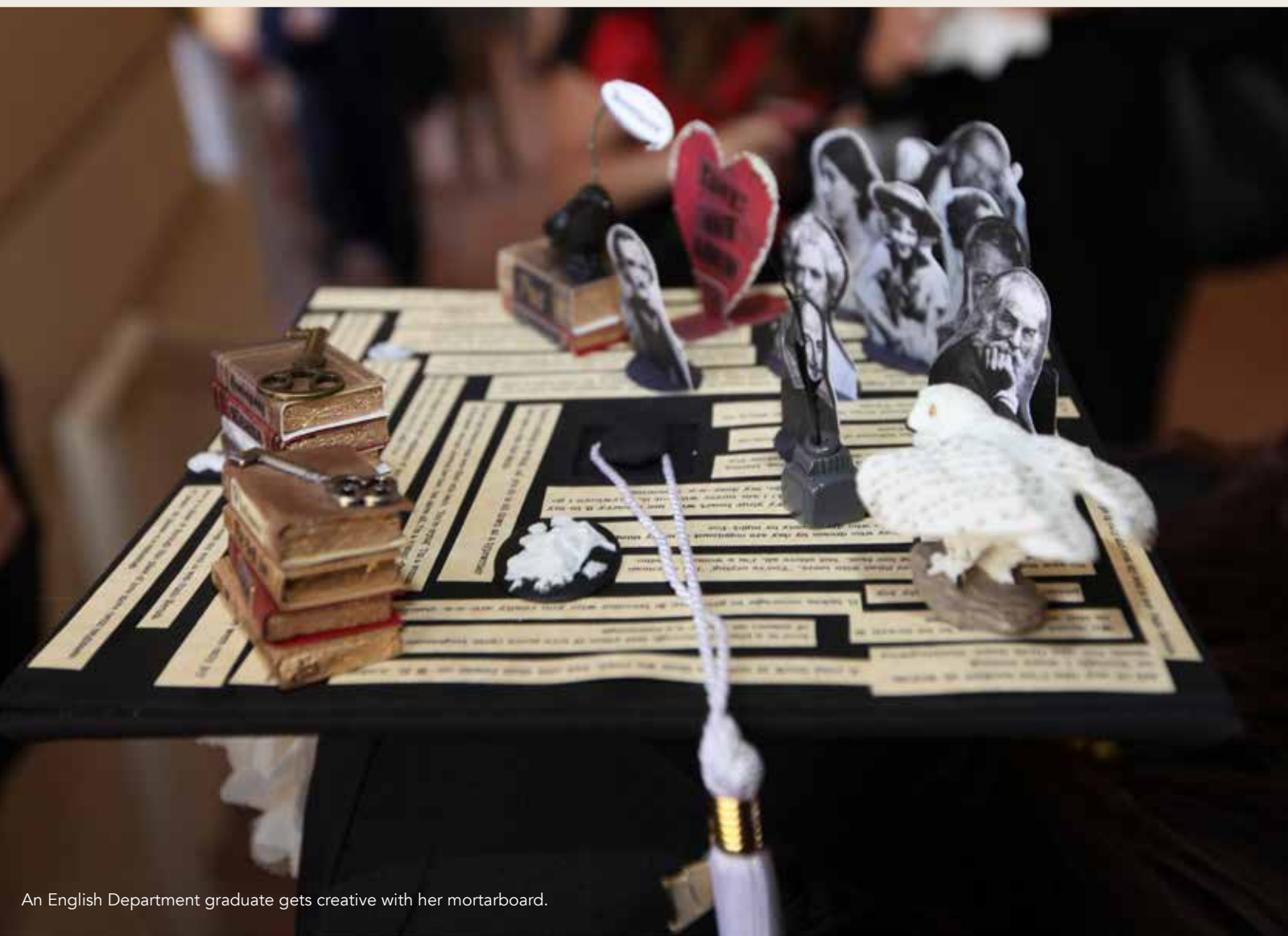
An English Department graduate gets creative with her mortarboard.

1 Grand Avenue San Luis Obispo, CA 93407-0322