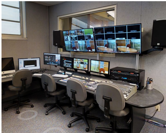
Upgraded television studio taken by the Journalism Department's new Matterport Pro 3D Camera.