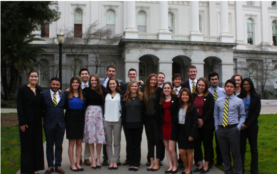
Cal Poly students visited state lawmakers in Sacramento.