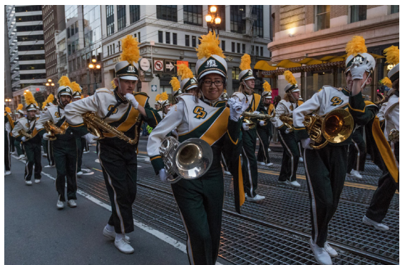
Mustang Band at 2017 Chinese New Year Parade