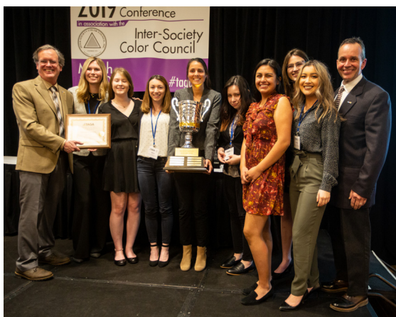
Cal Poly TAGA team with the Kipphan Cup