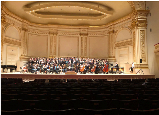
Cal Poly Choirs students rehearse in Carnegie Hall.