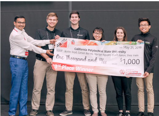
Cal Poly Team with the third-place award at the 48-Hour Re-Pack Competition.