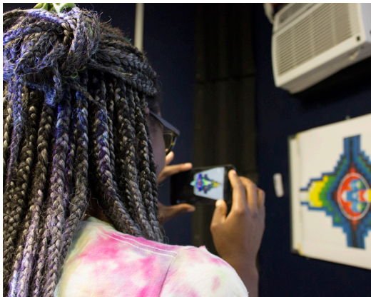
A student tests an augmented reality app developed by Cal Poly students