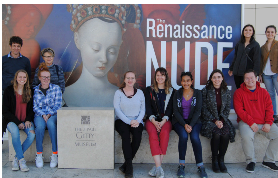
ART 371 students outside the Getty Museum