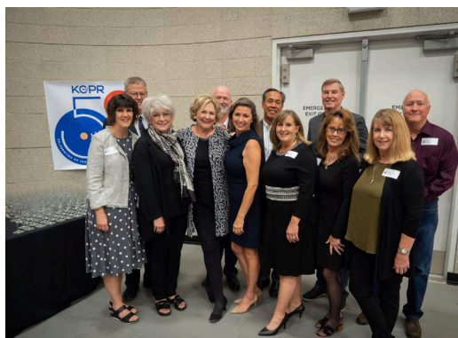
KCPR alumni gathered at the Mustang Media Hall of Fame and Through the Decades Gala celebrating KCPR's 50th anniversary