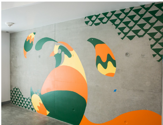
One of the 29 murals in the new residence halls at Cal Poly