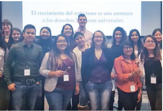
Cal Poly Spanish-language Debate Team at the Los Legados de Valladolid