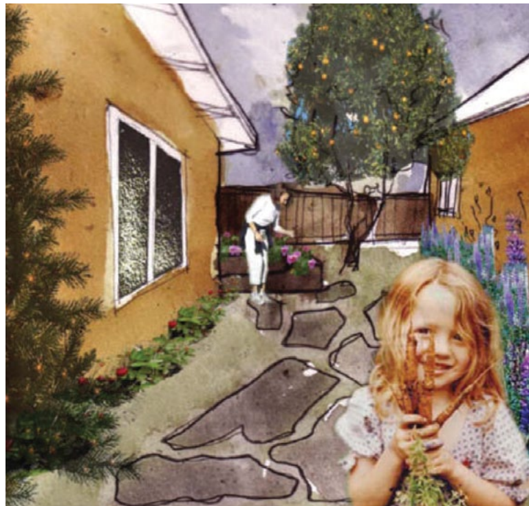
An EDES 408 team designed and installed a new landscape, including garden beds for the SLO Women's Shelter.

The minor includes two core courses team-taught by an interdisciplinary group of faculty from the College of Architecture & Environmental Design and electives offered by departments in almost every college. It involves collaboration