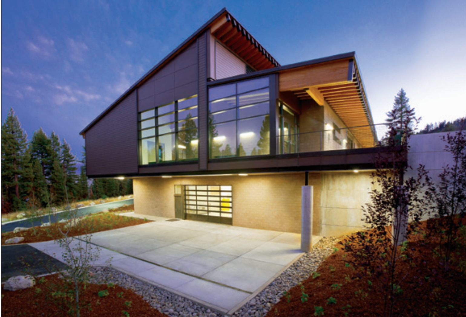
Tahoe High School, Career Tech Building in South Lake Tahoe (above)