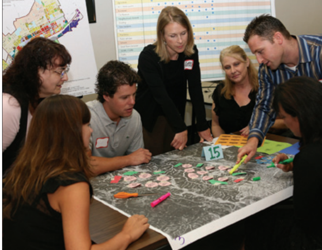
Students engage neighbors and stakeholders in the planning of a real-world community project.

Faculty members find real projects for clients in Western communities and hold studio labs in the Central Valley and major metropolitan areas. Students can work as interns and take design classes in programs in San Francisco, Los Angeles, Alexandria, Va., and in dozens of California offices participating in our Professional Studio Programs. Or they can head to Ahmedabad, the original Bauhaus in Dessau, Canberra, Copenhagen, Florence, Fontainebleau,