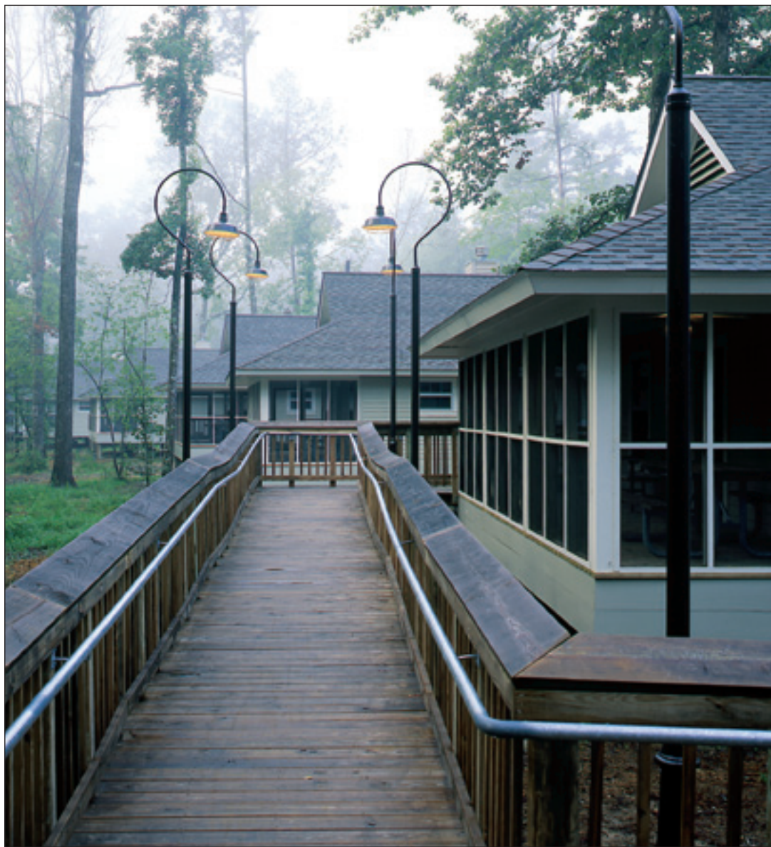
Cabin boardwalks in Louisiana's ecologically sensitive Tickfaw State Park (above)