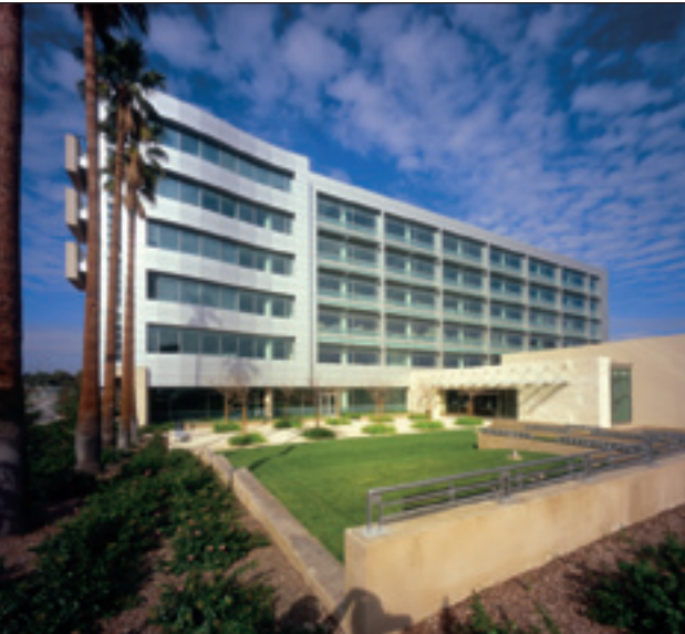
CSU Chancellor's Headquarters in Long Beach (above)