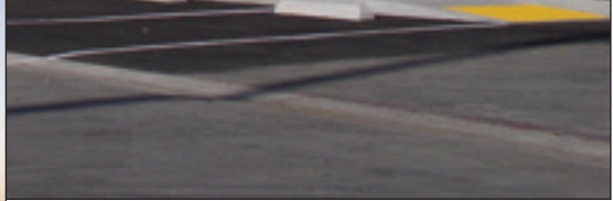
ATI's varied projects include the Orange County Fairgrounds Administration Building in Costa Mesa (top); Diablo Vista Middle School's Gymnasium in Danville (above); and the Mission College photo voltaic solar project in Santa Clara (right).