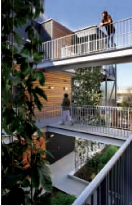
Gardner 1050 courtyard perspective (above)