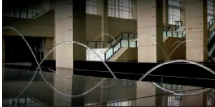
The McCormick Convention Center (left)