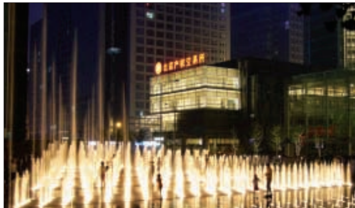
Illuminated waters at the Beijing Finance Center (left)

She credits her education at Cal Poly with equipping her to engage successfully with the many disciplines involved in her work today. While WET’s public face is high-profile design, behind its success is innovative technology, including energy-conscious propulsion.