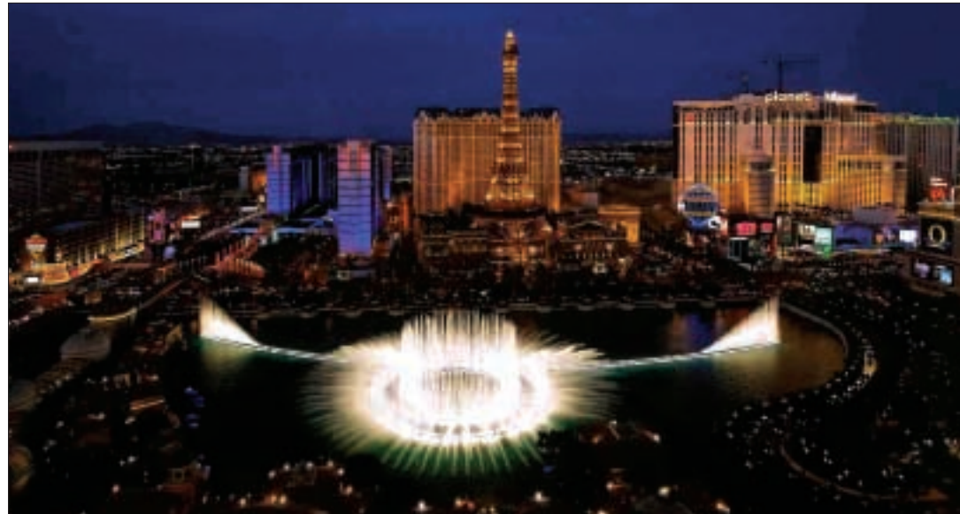
The Bellagio in Las Vegas (below)