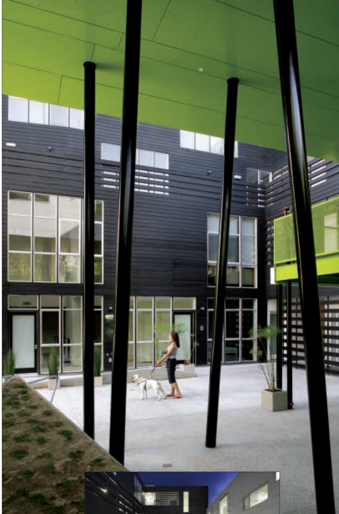
Habitat 825 courtyard: detail (above) and perspective (right)

“It’s a great time to be an architect now. I hope that the economy will mean the opening of other core avenues. Maybe it’s a time to give back and be community-driven. We can tighten belts to be socially relevant.” Possibly even the emergence of a new paradigm of social relevance for the profession.