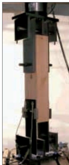
For the Simpson Strong-Tie project, WoodWorks provided information from tests performed by Douglas R. Rammer USDA Forest Products Laboratory to determine the effect of end spacing on wood splitting failure mechanisms (above and left).

efit continues once a tree becomes sawn lumber or an engineered wood product and is used for construction.