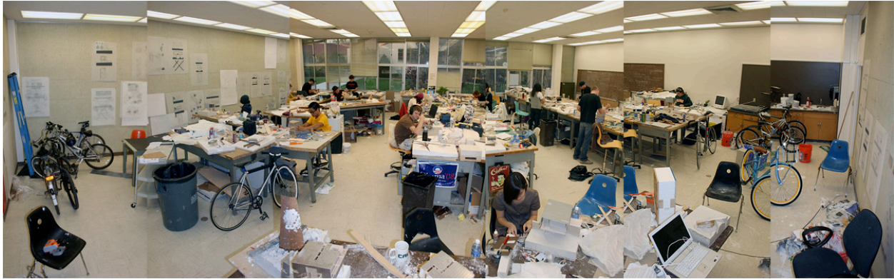
Figure 5: The studio environment enables Architecture programs to address higher levels of learning at regular and recurring points in their curricula.

than teach. After having the chance to observe architectural education firsthand, he became convinced that “architectural designing is a prototype of the kind of artistry that other professionals need most to acquire; and the design studio, with its characteristic pattern of learning by doing and coaching, exemplifies the predicaments inherent in any reflective practicum and the conditions and process essential its success. Thus, other professional schools can learn from architecture” 17 .