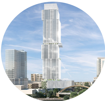
The Independent Austin, Texas