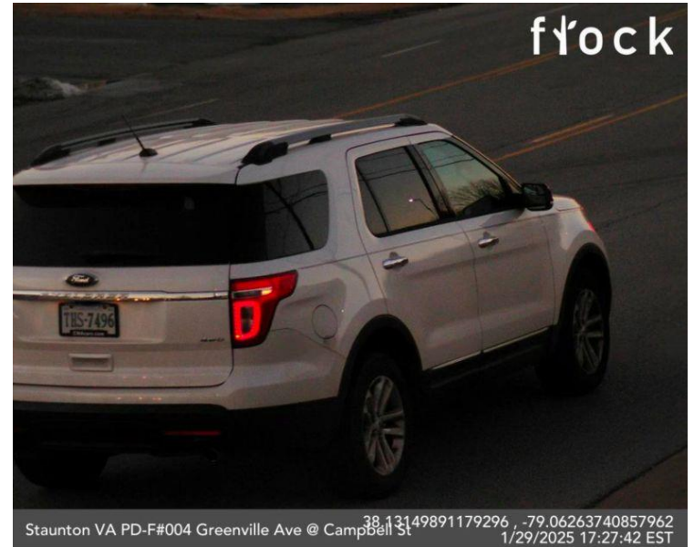
Staunton, Virginia

All live video feeds and ALPR images are stored for 30 days per CSU Policy.