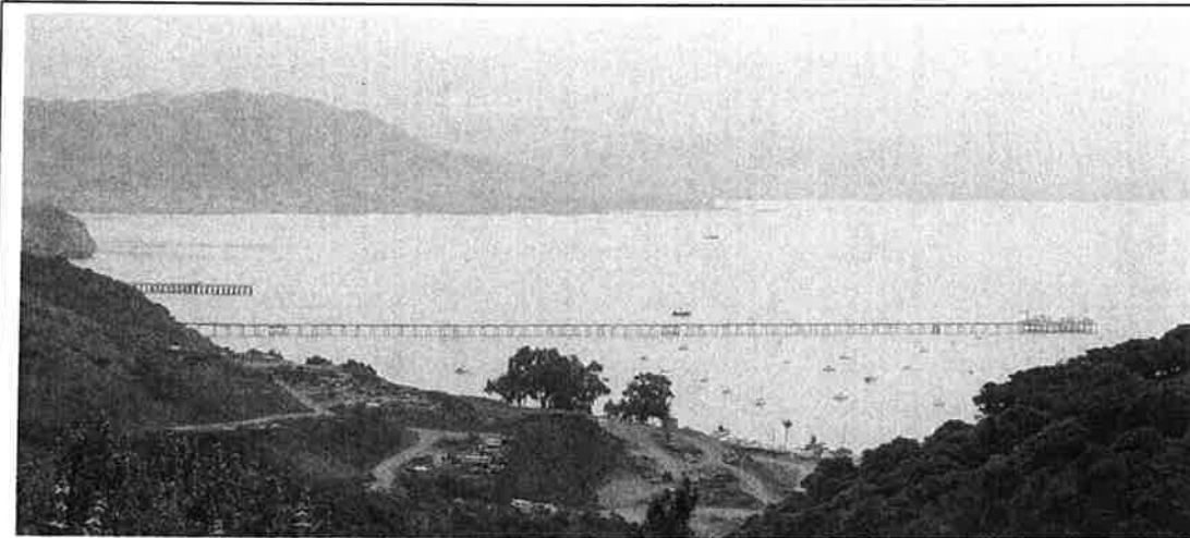
Figure 1. The Cal Poly Center for Marine and Coastal Sciences pier in San Luis Obispo Bay off Avila Beach, CA. The facility was donated in November, 2001 and is the center of Marine related activity at Cal Poly.

One of the most important components of the CCMS is access to the marine environment. This enables experimental manipulations in the field, equipment testing, environmental monitoring and a staging ground for other activities (i.e. boat launching, diving) for accessing additional sites. In November, 2001, the Unocal Corporation donated a kilometer-long, steel and concrete pier and oceanfront in San Luis Obispo Bay off of Avila Beach, CA to Cal Poly for use in developing a marine science education and research program ( Figure 1 ). Soon after, the facility was accepted by the CSU and Cal Poly for use as a marine station and laboratory. The pier facility, the facilities on campus and the program have been developing since then, towards the establishment of the CCMS. The current status of the facilities, activities and the plans for fiscal support are highlighted in the following section.